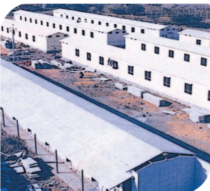
Reliance Petroleum Ltd. (Staff Accommodation) Mothikhavadi, Jamnagar, Gujarat

Birla Aerocon prefab structures are sturdy even in cyclonic and seismic zones. A structural study and analysis of the Birla Aerocon prefab structures in the aftermath of an earthquake, proved that they are of high strength and stability, their light weight generates minimal inertia force, their tongue and groove system permits adjustments for shock absorption and their steel angles provide sufficient ductility at the junction. In addition, their fire and moisture-resistant properties make them hardy survivors of climatic and accidental disasters. The Reliance Petroleum structures in Jamnagar, Gujarat, withstood the fury of the massive cyclone that hit in 1998. Again, when Gujarat bore the brunt of the killer quake in 2001, the Reliance Petroleum structure and the Gujarat Customs cabin, both built with Birla Aerocon solid Wall panels, remained unscathed.